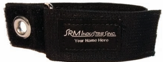
Private Brand Label Available on Heavy Duty RHINO CINCH STRAP™