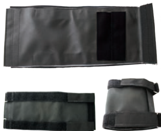
RHINO WRAP™ with interior pouch for certification card used on drill rigs

Contact us today to discuss what we can create for you!