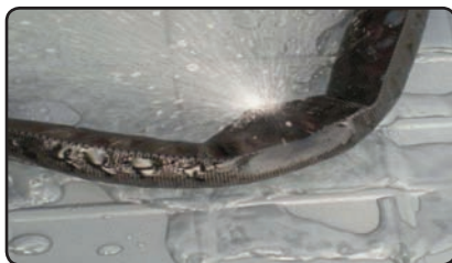
Actual picture of pin hole burst dispersion pattern at 4,000 P.S.I.