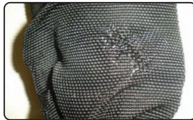
Close up of RHINO SLEEVE™ HT sleeving after pin hole burst