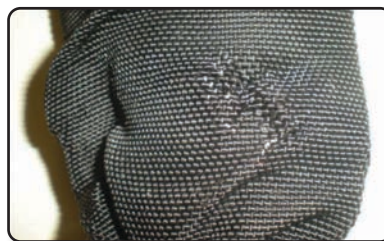
Close up of RHINO SLEEVE™ HT sleeving after pin hole burst